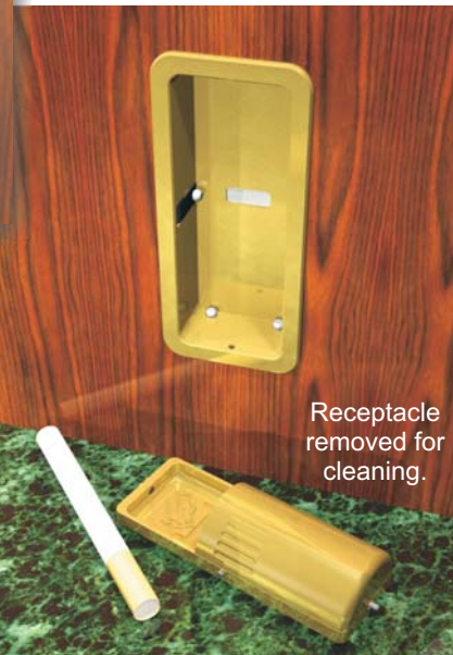
Receptacle removed for cleaning.