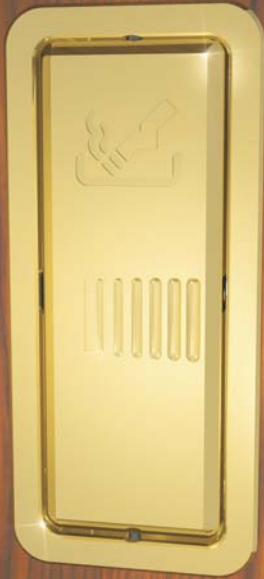
Inner receptacle rotated closed.