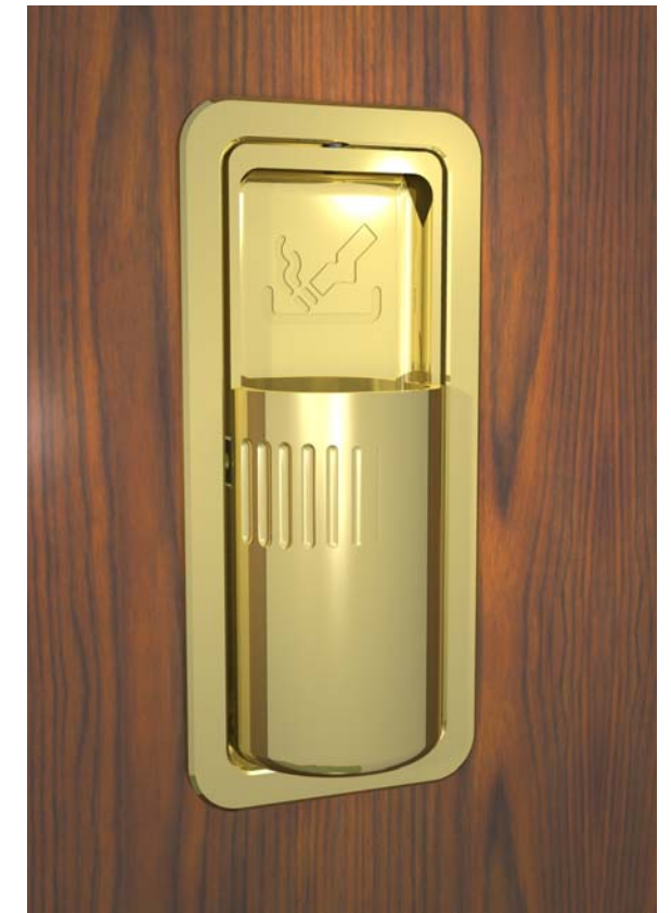
ILLUSTRATION SHOWN WITH A CUSTOMER SUPPLIED ELECTROPLATED FINISH. STANDARD FINISH IS RAW SATIN ALUMINUM READY FOR FINAL POLISHING AND PLATING.

THE DATA OR DESIGNS CONTAINED HEREIN ARE THE EXCLUSIVE PROPERTY OF HORIZON AVIATION GROUP OR CONTAIN PROPRIETARY RIGHTS OF OTHERS AND SHALL NOT BE USED, DISCLOSED, OR COPIED WITHOUT THE WRITTEN CONSENT OF HORIZON AVIATION GROUP.