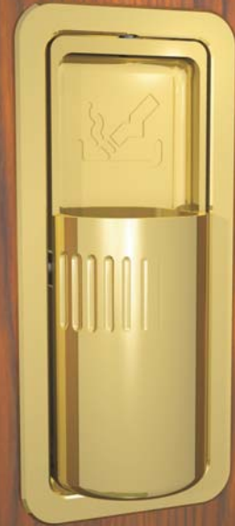
Inner receptacle rotated open.