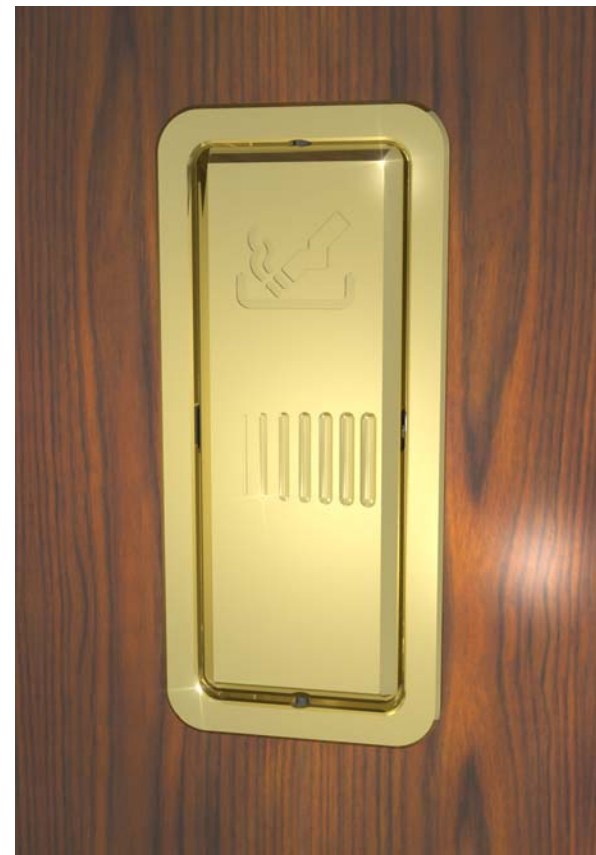
ILLUSTRATION SHOWN WITH A CUSTOMER SUPPLIED ELECTROPLATED FINISH. STANDARD FINISH IS RAW SATIN ALUMINUM READY FOR FINAL POLISHING AND PLATING.

.75" THICK BULKHEAD WITH .060" COVERING MATERIAL. (REF)