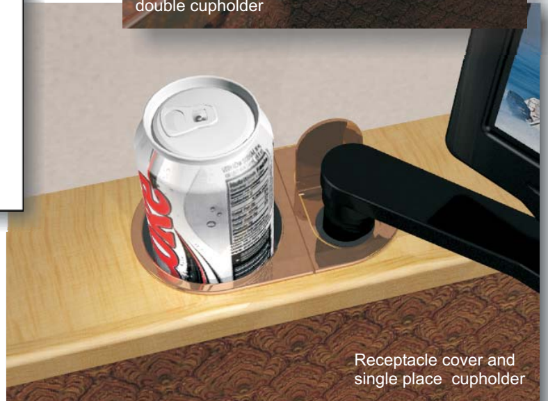
Receptacle cover and single place cupholder

Units are custom made for each application and style of receptacle.