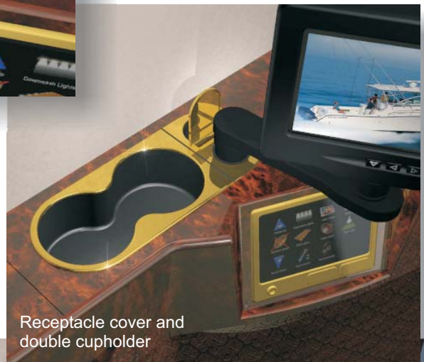
Receptacle cover and double cupholder