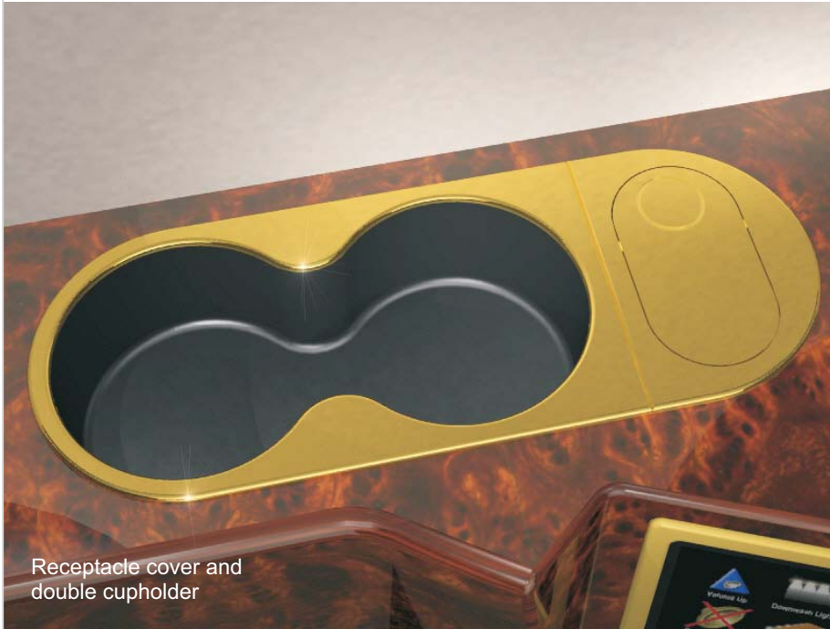
Receptacle cover and double cupholder